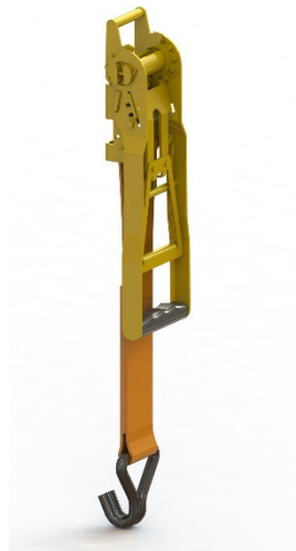
Long handle ERGO ratchet